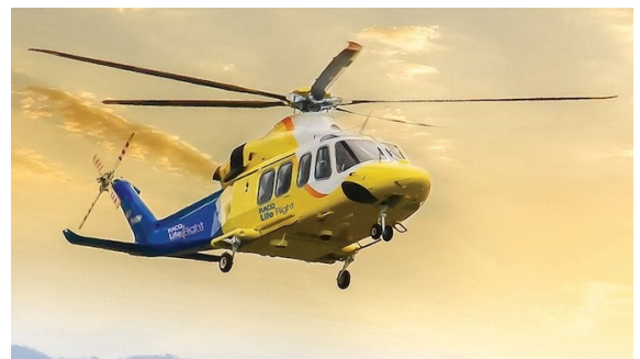
RACQ Life Flight Rescue

Wednesday, 8th March - RACQ Lifeflight Rescue has been providing an emergency rescue helicopter service to the Queensland regions for 35 years. Our tour will be at the Sunshine Coast Hangar. Take this opportunity to see how this essential service operates. For safety reasons this tour is limited to 30 persons. Closed in shoes must be worn or you will not be admitted to the hangar. Lunch is at the Maroochy Bridge Hotel. Members cost $63.00. Bookings close 17th February, 2017