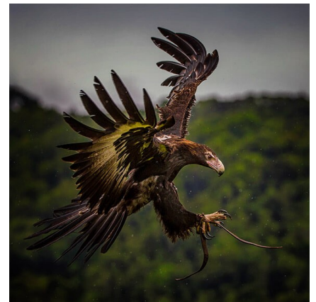
O'Reilly's Rainforest Birds of Prey

Please advise which options you would like when booking. Light lunches can be purchased at Mountain Café and gifts or B.Y.O. Set lunch in the restaurant will be roast and vegetables w/bread roll. Apple crumble and custard / tea or coffee. Prices quoted are members costs. Bookings close 22nd December, 2016.