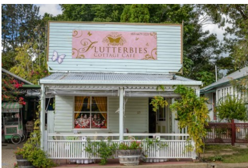
Valentines Luncheon Flutterbies Cottage Café

Monday, 13th February - Today's visit will take us into "The Heart of the Caldera" to the rural village of Tyalgum, a place of history and country charm, originally a cedar felling outpost. Today Tyalgum is home to a growing community of people drawn to the peace and natural beauty of the area. Tyalgum is surrounded by the spectacular scenery of the World Heritage listed Gondwana Rainforest of Australia and includes Mount Warning, the Border Ranges and Mebbin National Parks. We will start the day with morning tea at Point Danger before travelling through Murwillumbah to Tyalgum. Members cost $55.00. Bookings close 23rd January, 2017