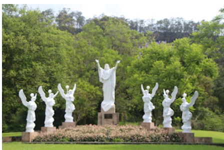
Marian Valley Monastery, Witheren