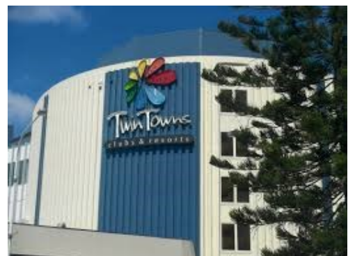
Back to the Tivoli