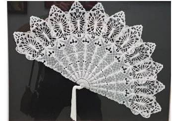
Samples of parchment craft as displayed at the Donald Simpson Centre.