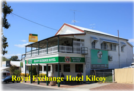
Summer's Day Country Touring

Wednesday, 11th January - The first stop on our leisurely trip out into the countryside, will be a morning tea break in Fernvale. Then it is on to Esk where, weather and time permitting, we will stop for a short stay in the popular country village. Our journey will then take us through Cabooabah and skirt around Somerset Dam to Hazeldean. From here we travel to Kilcoy for our lunch at the Exchange Hotel (alternate drop menu). Sit back and enjoy the scenery with a pleasant outing to start the New Year. Members cost $52.00. Bookings close 20th December 2016.