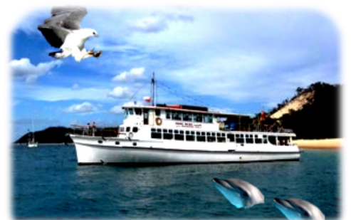
Brisbane to Gold Coast M.V. Lady Brisbane

Friday, 31st March - Cruise to the Gold Coast and experience what makes the marine area so unique by sightseeing in sheltered waters and discovering the breath taking natural beauty of 300 Whitsunday style islands, as well as the Broadwater, Sovereign Island, Tipplers Resort, Couran Cove, Jumpinpin, Moreton Bay Park and the Brisbane River. Watch for marine wildlife such as dugongs, dolphins, black swans, turtles and sea eagles. Enjoy a lovely Autumn day on the water. Morning tea, barbecue lunch and afternoon tea will be served whilst cruising. We return to the Centre by coach. Members Cost $99.00 Bookings close 10th March, 2017