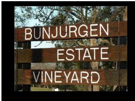
Bunjurgan Estate Vineyard