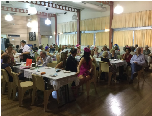
“Who Won ?”