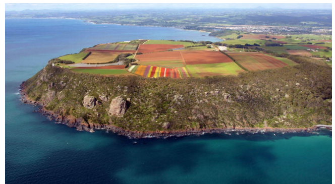
Table Cape Tulips

24th September 2015 - Spring in Tasmania (13 days). A comprehensive tour visiting the beautiful Table Cape Tulips, Emu Valley Rhododendron Gardens, Cradle Mountain & Dove Lake, West Coast Wilderness Railway, Grindewald, and many other outstanding attractions.