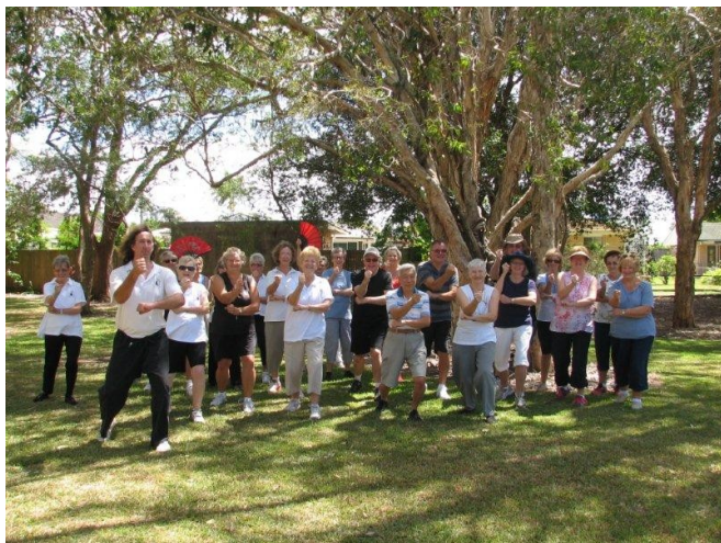
Imperial Tai Chi Academy practicing Tai Chi in the park