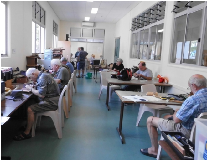
Plenty of room for more leather workers