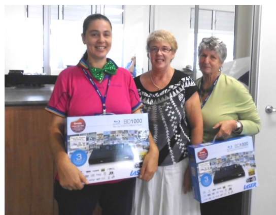
Yarrabee Nursing Home donation