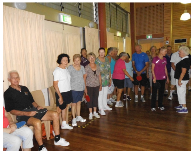
This is a photo of the Friday afternoon group, eager to begin play!!!