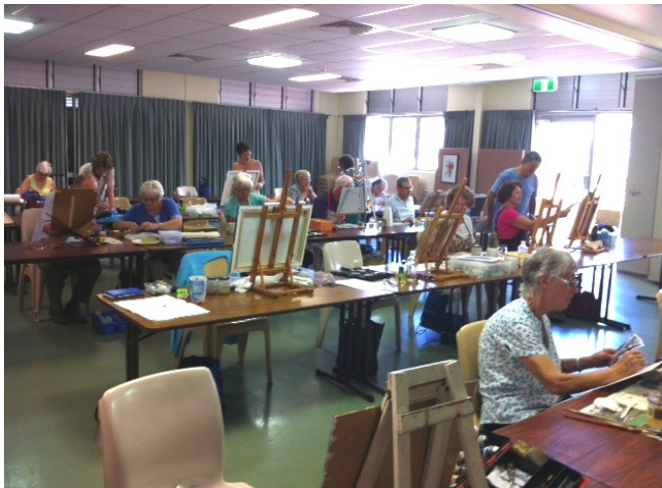
Our cheerful, airconditioned art room

New members are always welcome, be they beginners or experienced. Although we do not have a designated teacher, we do have many talented artists willing to share their knowledge and expertise in their particular medium, whether it is oil, watercolour, acrylic, pastel or pencil. So, if you have the desire to create pictures in the company of like minded people, do join us. Bring your own supplies and share in a creative Tuesday morning in good company from 8.30 am to 11.45 am.